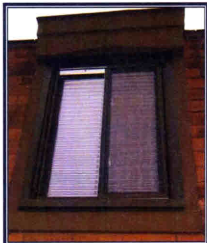
Actual Acacia Project Photos